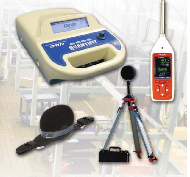
Whether you are looking for the Quantifit® Respirator Fit Tester, Noise Dosimeters, Sound Level Meters, or Environmental Noise Monitoring System, we can provide you with a complete solution.