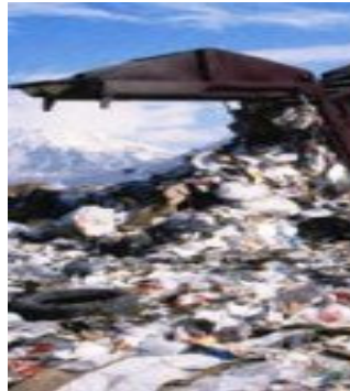
Waste & Recycling