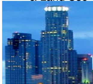
Local Initiatives & Land Use